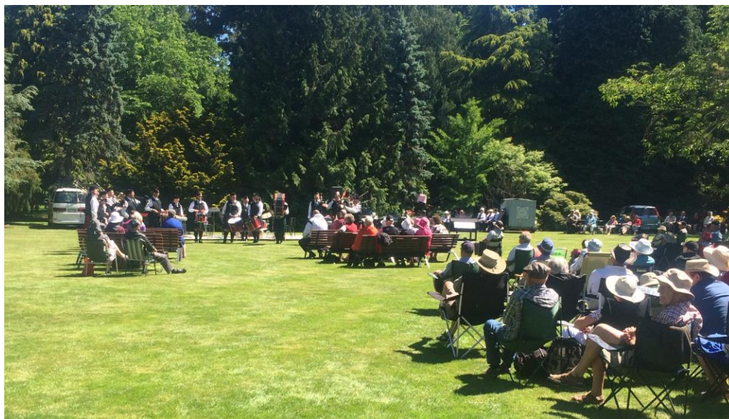
Bands in the Domain concert – Ashburton Domain 2019

Community Trust Mid and South Canterbury: ceo@comtrust.org.nz : ph: 03 687 7361