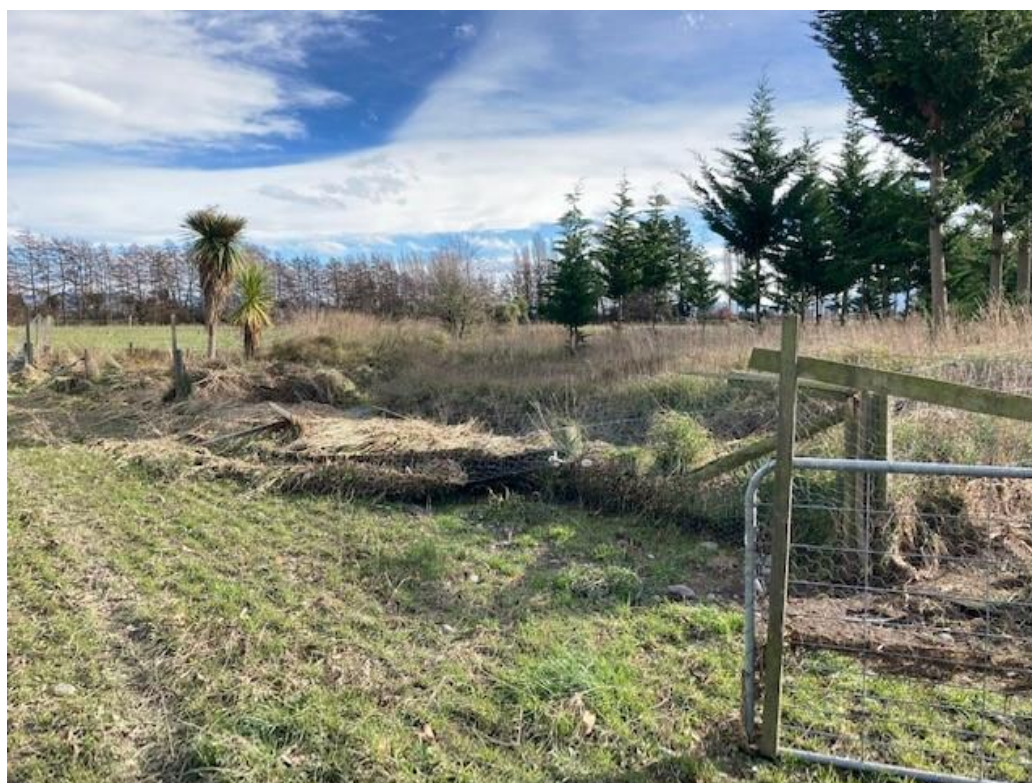
Fencing has been extensively damaged after recent flooding at Riverbridge Native Species Trust - Ashburton