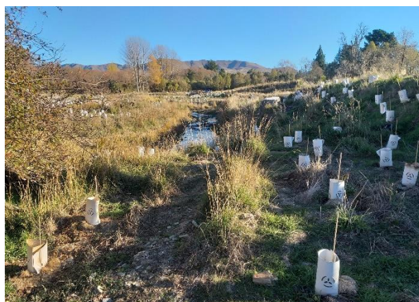
Burkes Pass Riparian Planting

"The Te Kopi o Opihi/Burkes Pass Riparian Restoration Group are delighted to receive news of your wonderful support that will enable us to protect the existing native planting from browsing animals and clear the way for stage 2 planting with a future community track along the Opihi River giving environmental and cultural benefits for all to enjoy."