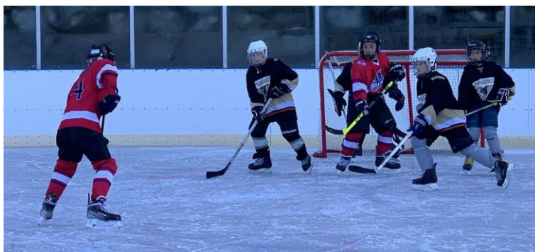
Mackenzie Ice Hockey Club