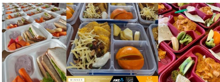
Kai for Kids

In Ashburton , a total of $40,000 was granted including $10,000 to Ashburton Youth Health Trust for the HYPE Youth Centre, $10,000 to Hakatere Multicultural Council for operational costs, $5,000 to Kai for Kids for their school lunch programme, $5,000 to Riverbridge Native Species Trust for the wetland development project, $5,000 to Dementia Canterbury for their free support services in Ashburton, $3,000 to Ashburton District Neighbourhood Support for operational costs, and $2,000 to Ashburton Speedway Association for operating costs.