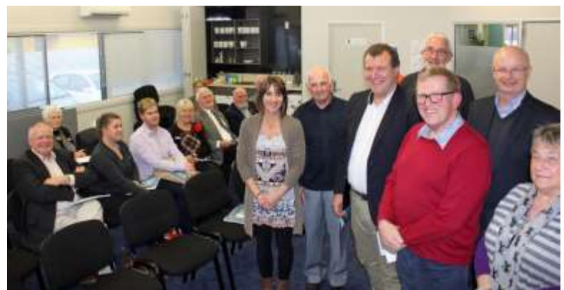
Community House Mid Canterbury celebrate the first AGM in their new premises