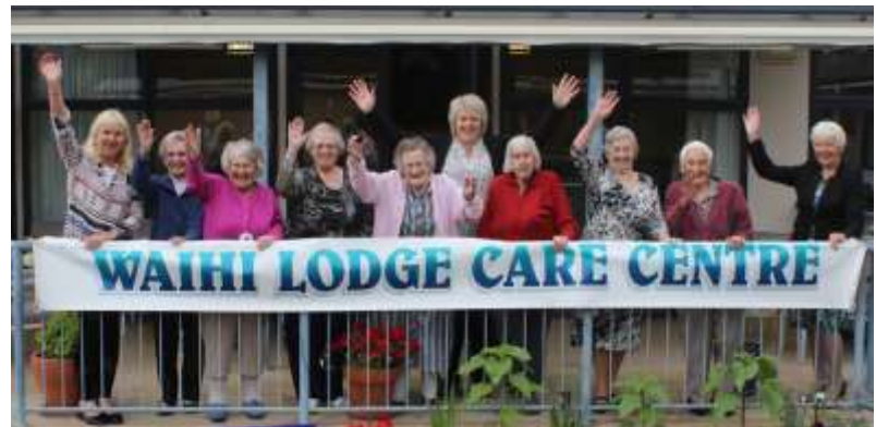
Seniorcare Geraldine - Waihi Lodge upgrade