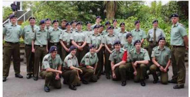
Timaru Cadet Unit – new equipment