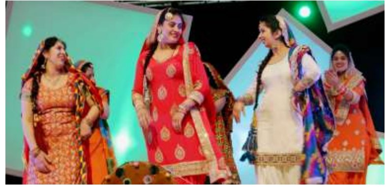
Colourful Diwali Festival 2016 – SC Indian Society