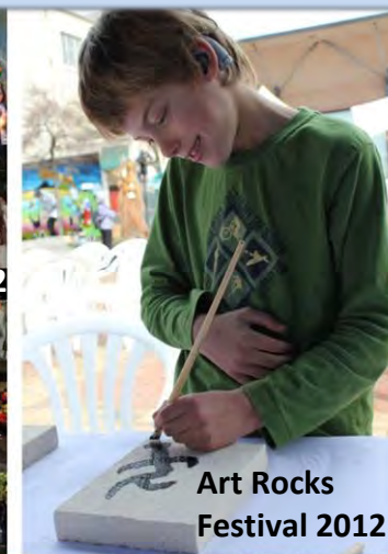
Art Rocks Festival 2012