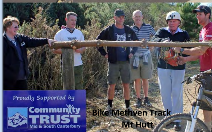
Bike Methven Track Mt Hutt