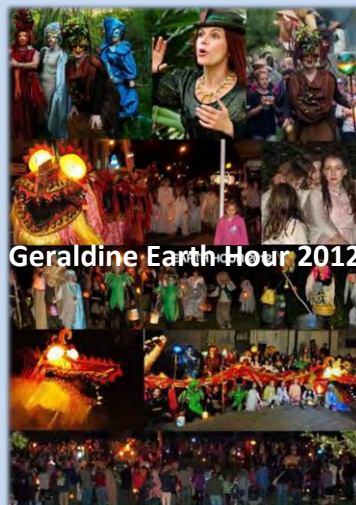
Geraldine Earth Hour 2012

Supporting community organisations to achieve a region of healthy, vibrant and caring communities