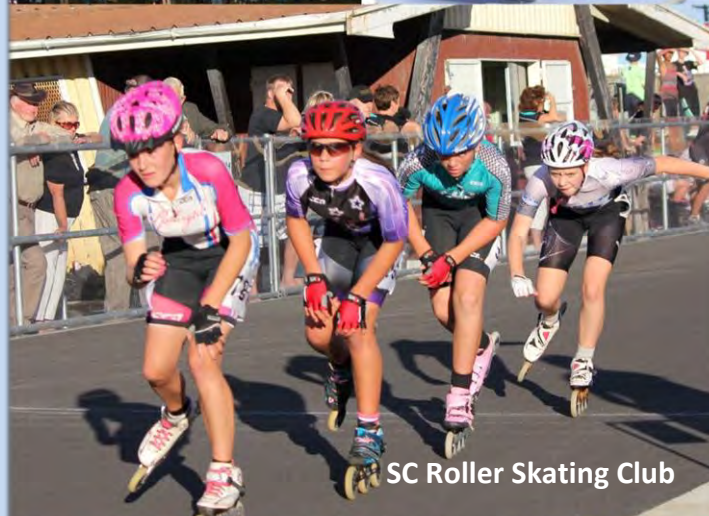
SC Roller Skating Club