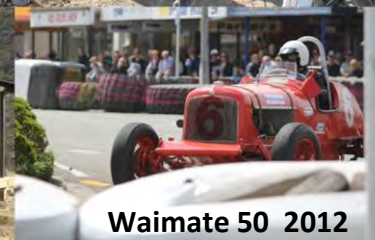
Waimate 50 2012