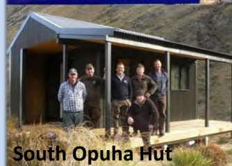
South Opuha Hut