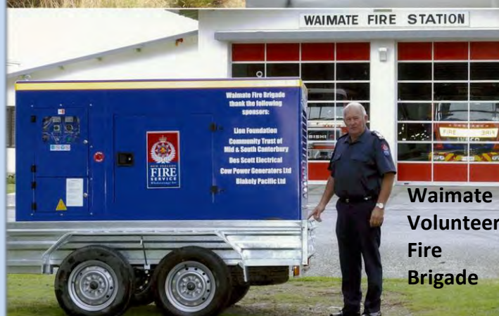
Waimate Volunteer Fire Brigade